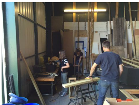
Junior tab team working away down the Land.

There are several procession route changes this year all of which are in this year's Programme available from Lewes Information Centre., Leicester Road Newsagents, St Mary's Supporters Club and Winterbourne Stores.